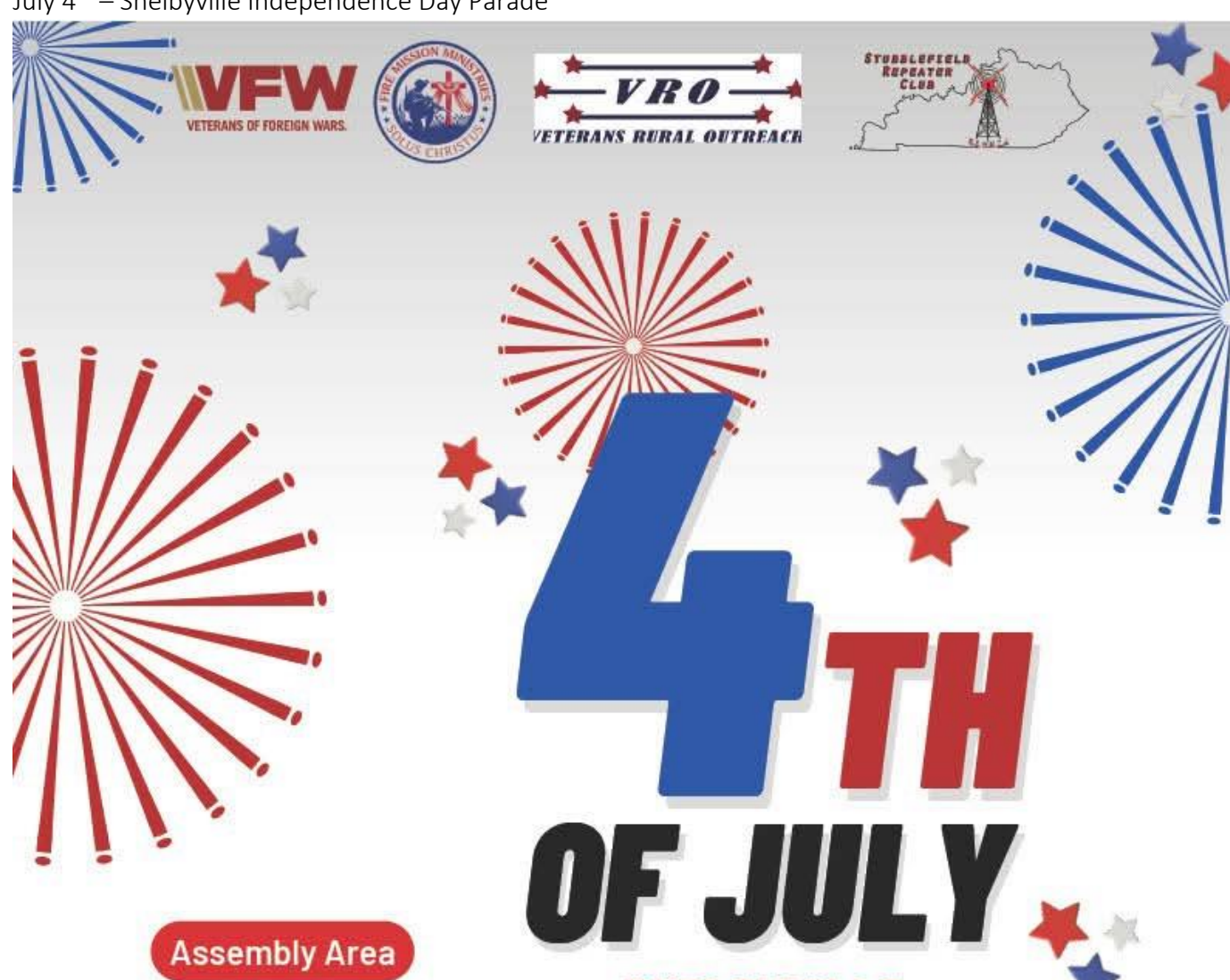
July 4<sup>th</sup> – Shelbyville Independence Day Parade

SHELBYVILLE FIRST BAPTIST CHURCH PARKING LOT 9AM