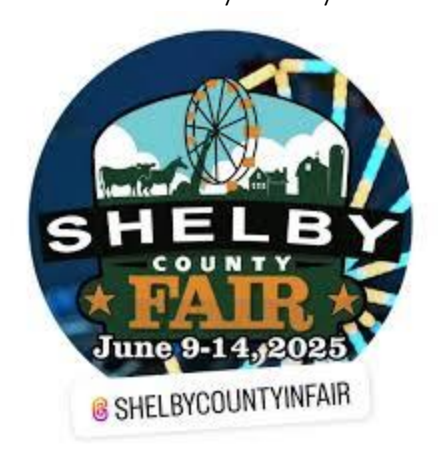
June 9-14 – Shelby County Fair

June 17<sup>th</sup> – Shelby County Classic Horse Show