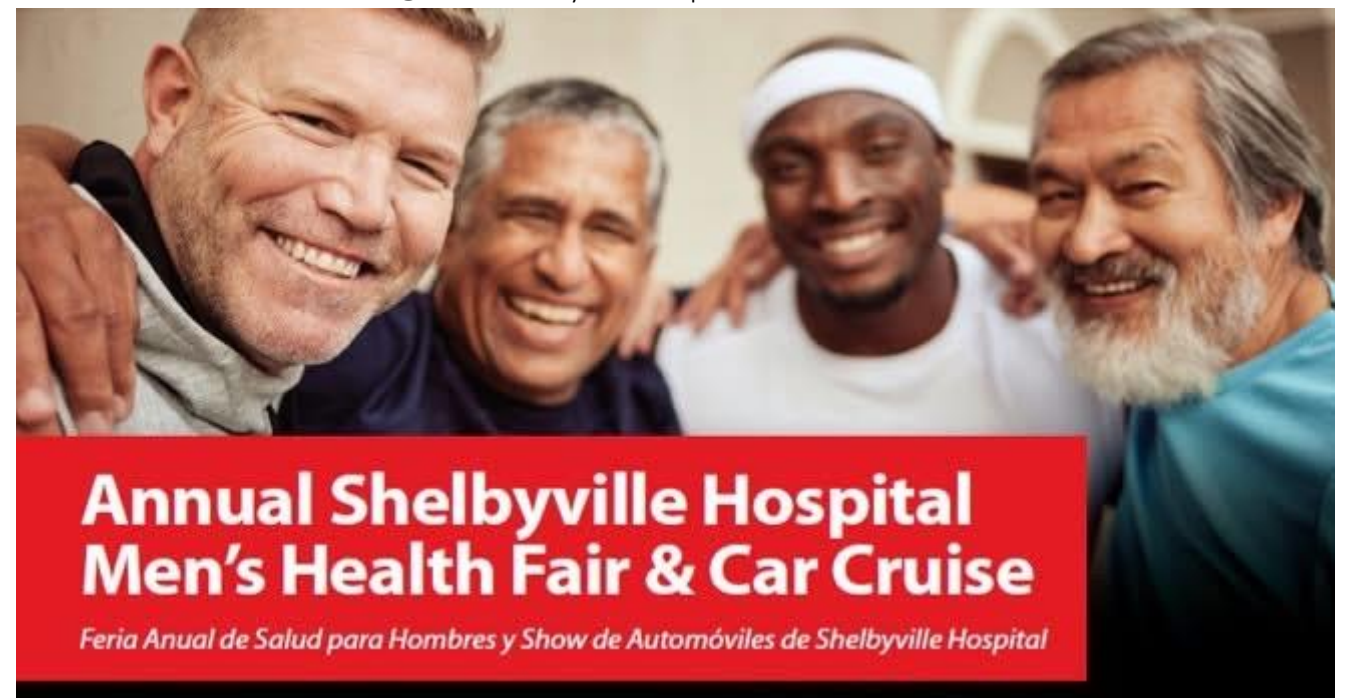
June 21<sup>st</sup> – Men's Health Fair @ UofL Shelbyville Hospital