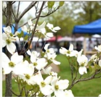
Dogwoods Bloom on Main