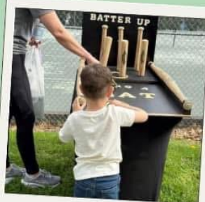
Games and Family Fun