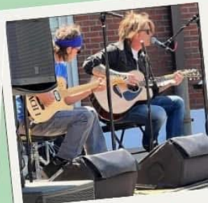
Musicians and Local Talent