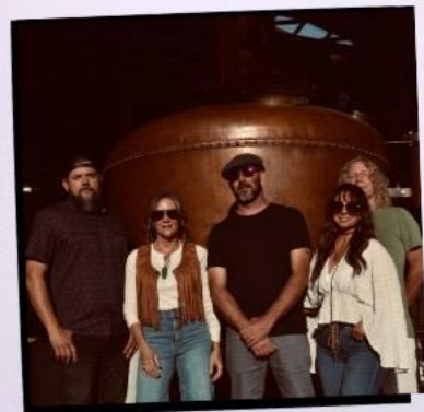
The Pretty Goods!